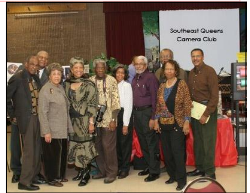
African Global Village Celebration